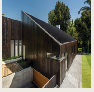
Roof colour: Monument® Matt