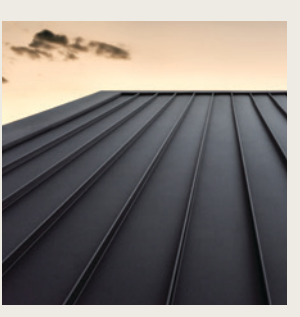
Roof colour: Monument® Matt