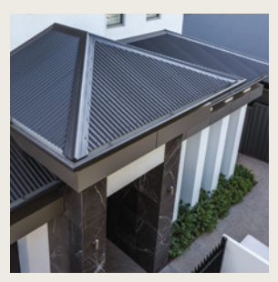
Roof colour: Monument® Matt

COLORBOND® steel Matt incorporates our unique Thermatech® solar reflectance technology, designed to reflect more of the sun's heat on hot sunny days. It also benefits from our industry-leading coating incorporating Activate® technology to provide enhanced corrosion resistance.