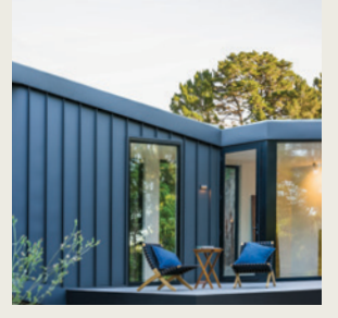
Wall colour: Monument® Matt

For over a decade COLORBOND® steel Matt has undergone real world exposure testing and accelerated laboratory testing at BlueScope sites in Australia. COLORBOND® steel Matt is also manufactured in Australia and compliant with relevant Australian Standards.