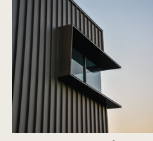
Wall colour: Monument® Matt

When you purchase COLORBOND® steel Matt you are buying products made and backed by BlueScope, one of Australia's largest manufacturers. BlueScope offers a range of warranties of up to 36 years for peace of mind¹.