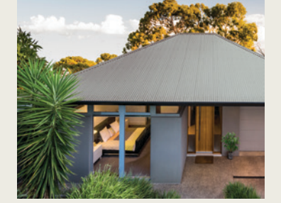
Roof colour: Shale \mathsf{Grey}^{\scriptscriptstyle\mathsf{TM}} Matt