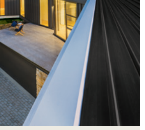
Roof colour: Monument® Matt

Tested for over a decade, COLORBOND® steel Matt has been designed to withstand our harsh Australian environment. The result is a product which maintains its Matt finish, looking even better for longer.